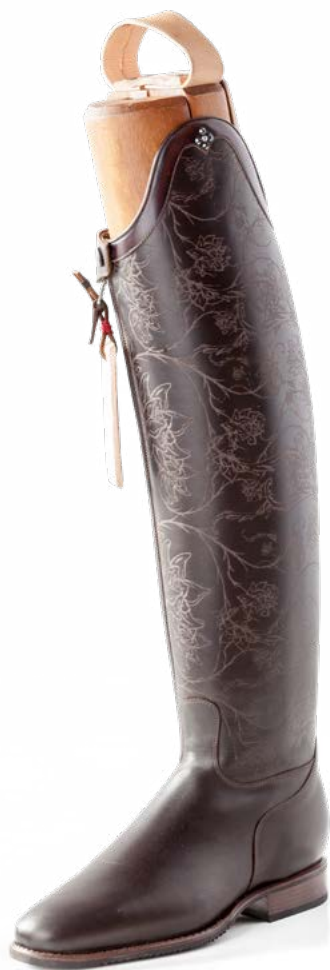
RAFFAELLO TOP RONDINE GG13

Boot in caffè engraved leather Rondine top design in brushed brown leather and one flower in the middle